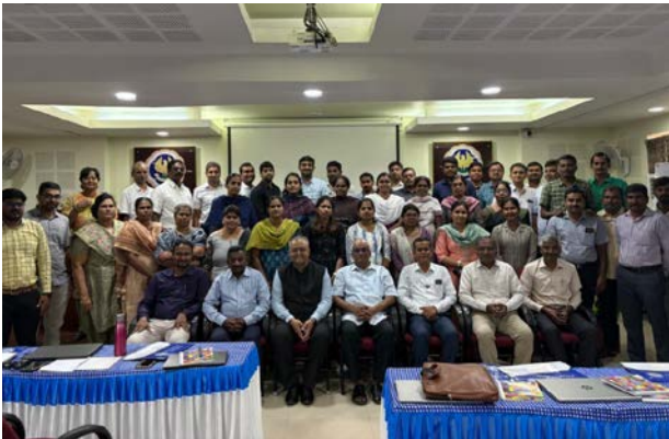
AICA LEVEL 1 COURSE ON 10.01.2025-12.01.2025 AT ICAI BHAWAN, TIRUPUR