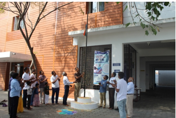
REPUBLIC DAY CELEBRATION ON 26.01.2025 AT ICAI BHAWAN, TIRUPUR