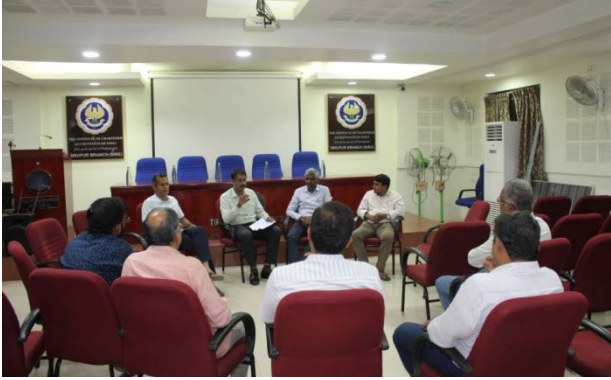
STUDY CIRCLE MEETING ON 06.01.2025 AT ICAI BHAWAN, TIRUPUR