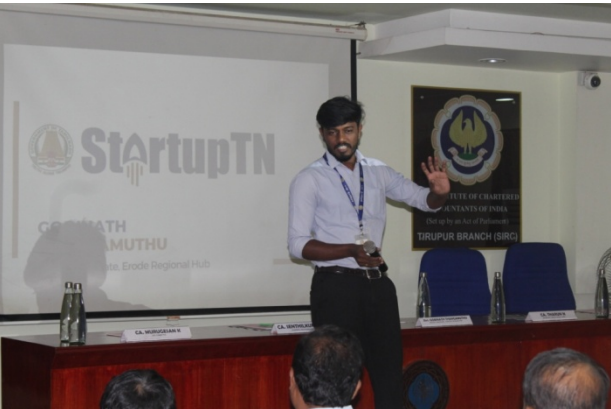
ICAI STARTUP SAMVAD PROGRAMME ON 24.01.2025 AT ICAI BHAWAN, TIRUPUR